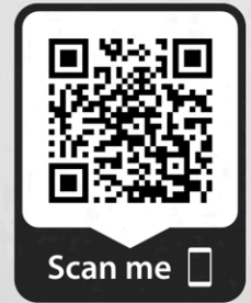
GH3+ Video Introduction and Basic Inservice Session